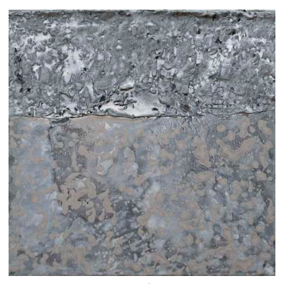
Grigio, 2019 acrylic on canvas, 18 x 18 in

The Drawing Room is pleased to announce an online presentation of new paintings by Hector Leonardi with an illustrated digital catalog on the gallery's website: www.drawingroom-gallery.com. While the gallery remains closed temporarily, we encourage those on the East End to keep an eye on our storefront window at 55 Main Street for a changing selection of exhibition highlights.